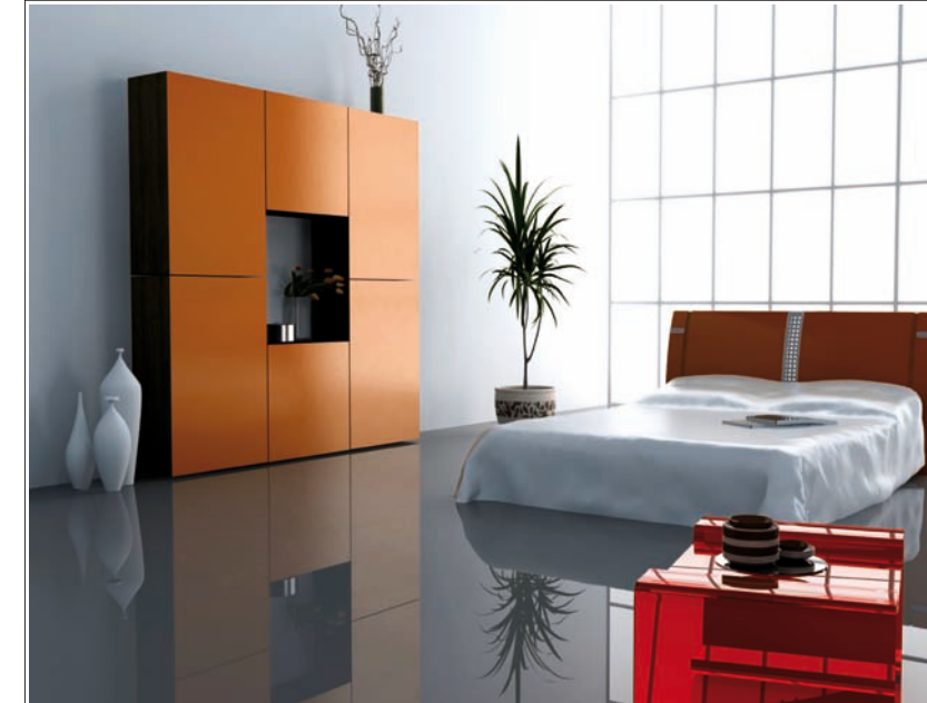
Elite® Range - Nominal Sizes (mm)

CAD image of the new flush-fitting Elite®